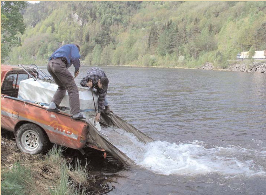
Releasing smolts in the River Mandal, Norway as part of a stock rebuilding programme.