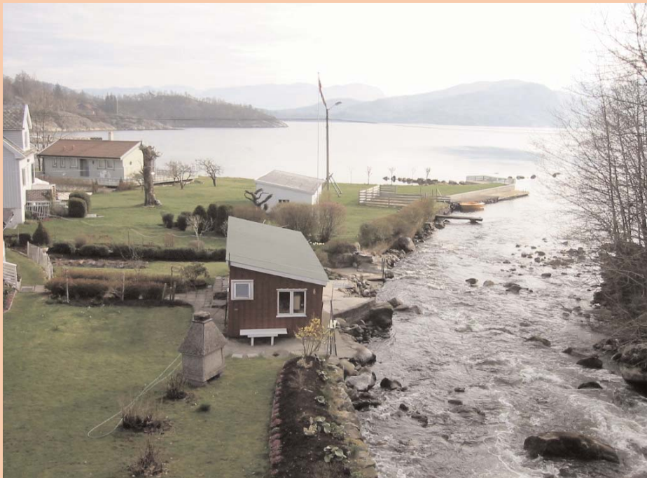
The River Imsa, Norway where life-cycle experiments with farmed and wild salmon and their crosses have contributed to understanding the interactions between wild and cultured salmon.