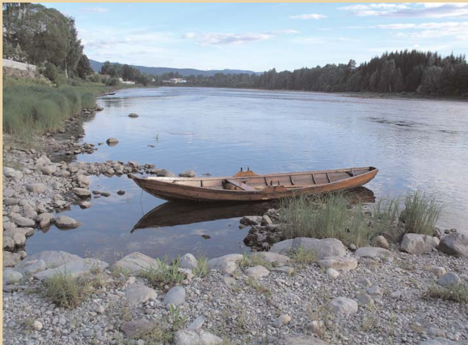
The River Drammen, Norway where stocking is being used to mitigate losses caused by the parasite Gyrodactylus salaris .