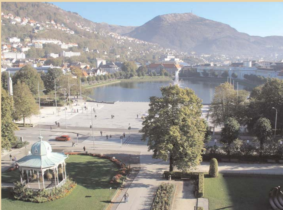
The City of Bergen.