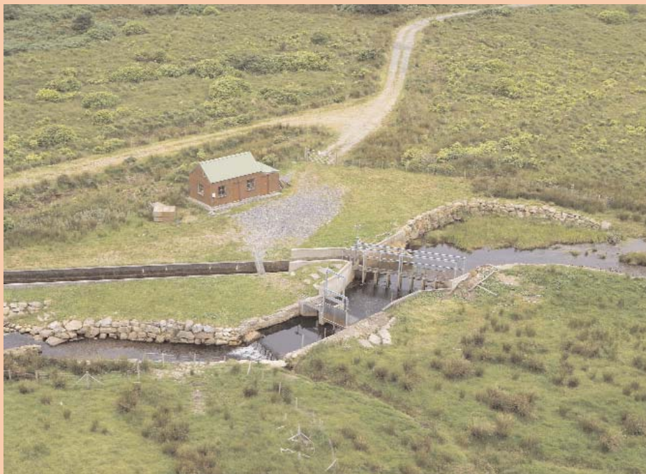
The trap on the Srahrevagh River, a tributary of the Burrishoole River, used in experiments designed to increase understanding of wild and cultured salmon interactions.